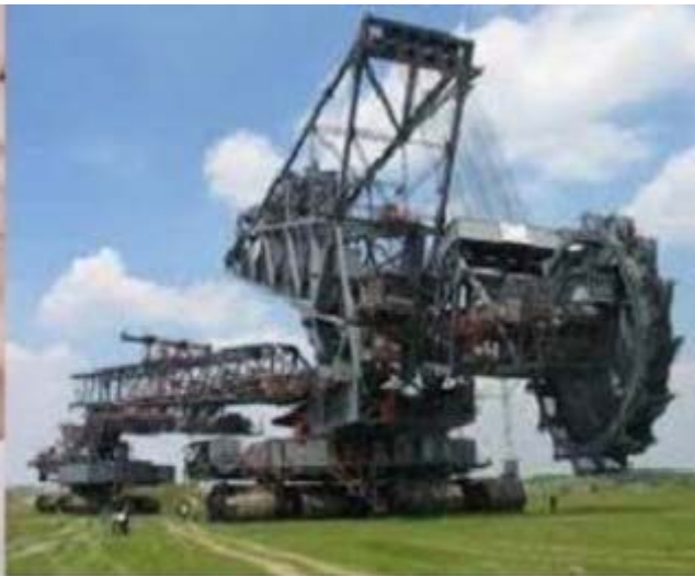
Shovel MSM uses for GOP scandals