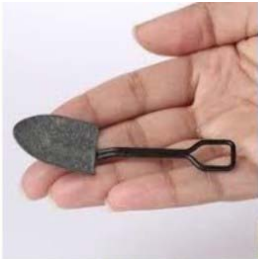
Shovel MSM uses to dig into Democrat scandals