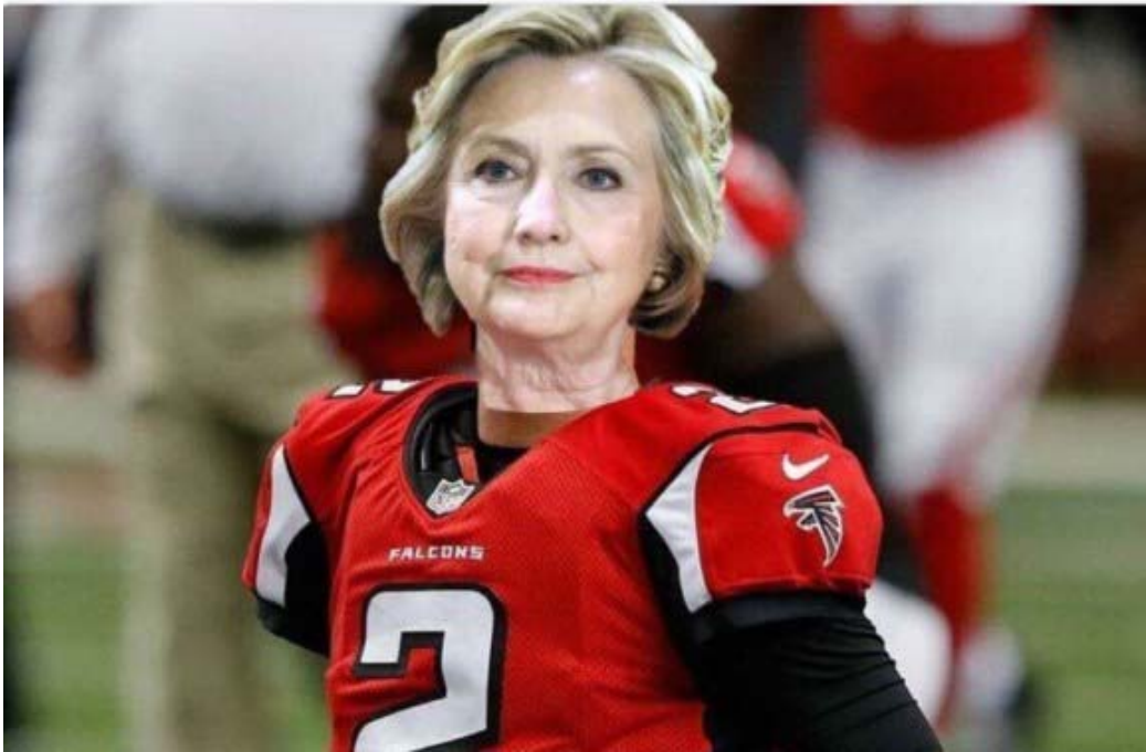
William Tecumseh Sherman