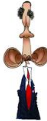
B. HOT AIR.