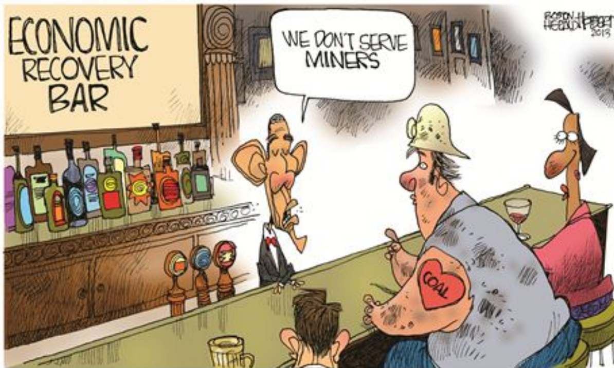
OBAMA'S CLIMATE CONTROL PLAN IS ANTI-COAL