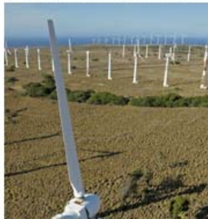
Abandoned wind farm at South Point Hawaii

There are many hidden truths about the world of wind turbines from the pollution and environmental damage caused in China by manufacturing bird choppers, the blight on people's lives of noise and the flicker factor and the countless numbers of birds that are killed each year by these blots on the landscape.