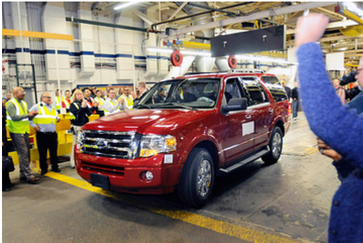
The profitable part of Detroit.

Leave it to Bob Lutz, GM's voluble vice chairman, to puncture the unreality of the auto bailout he himself has been championing. In an email to Ward's Auto World, he notes an obvious flaw in Congress's rescue plan now taking shape: The fuel-efficient "green" cars GM, Ford and Chrysler profess to be thrilled to be developing at Congress's behest will be unsellable unless gas prices are much higher than today's.